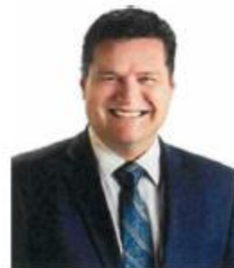
Honourable James Teitsma Minister of Consumer Protection and Government Services