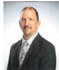
Joseph Dunford Deputy Minister of Consumer Protection and Government Services